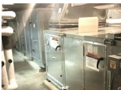
HVAC Renovation Bridge Point ES, Hill Country MS, Westlake HS