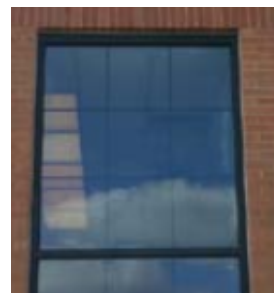
Window Replacements West Ridge MS - Phase 2