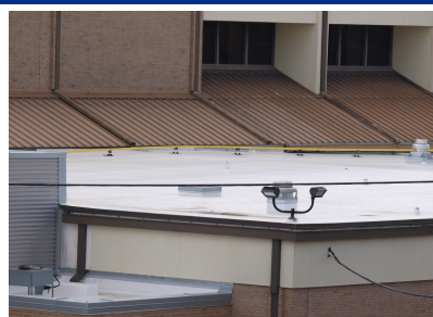
Roofing Westlake HS - Phase 2