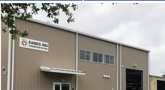
Existing Transportation Facility Renovations/Additions