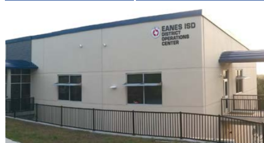
District Operations Center (DOC) New build to house M&O, Technology, Rentals & Safety