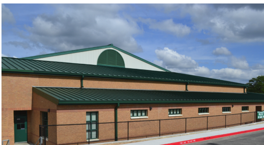
Fine Arts Additions Hill Country MS, West Ridge MS